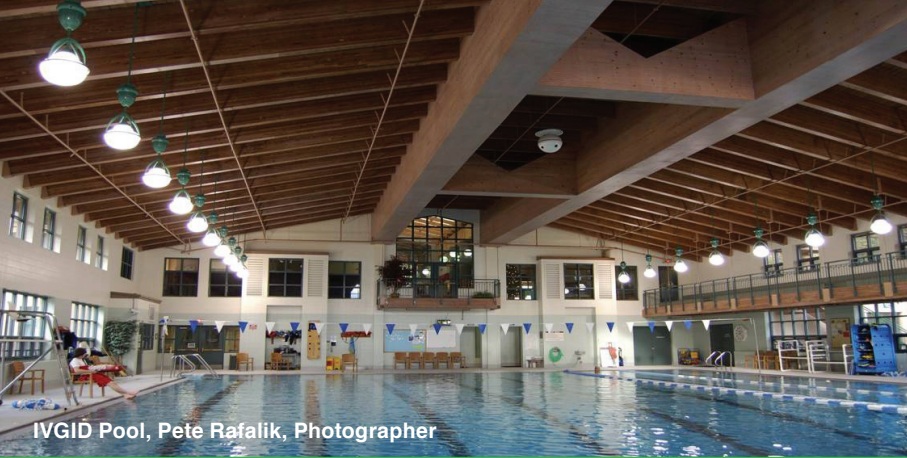
IVGID Pool

Light + Space was founded in 2002 by Lee Harris, an electrical engineer with more than 20 years of experience in the lighting industry. Light + Space has successfully provided lighting design for parking garages, bridges, city and county council chambers, offices, schools, teleconference rooms, casinos, retail, restaurant/bars, houses of worship, art galleries, natatoriums, landscape projects, and more.